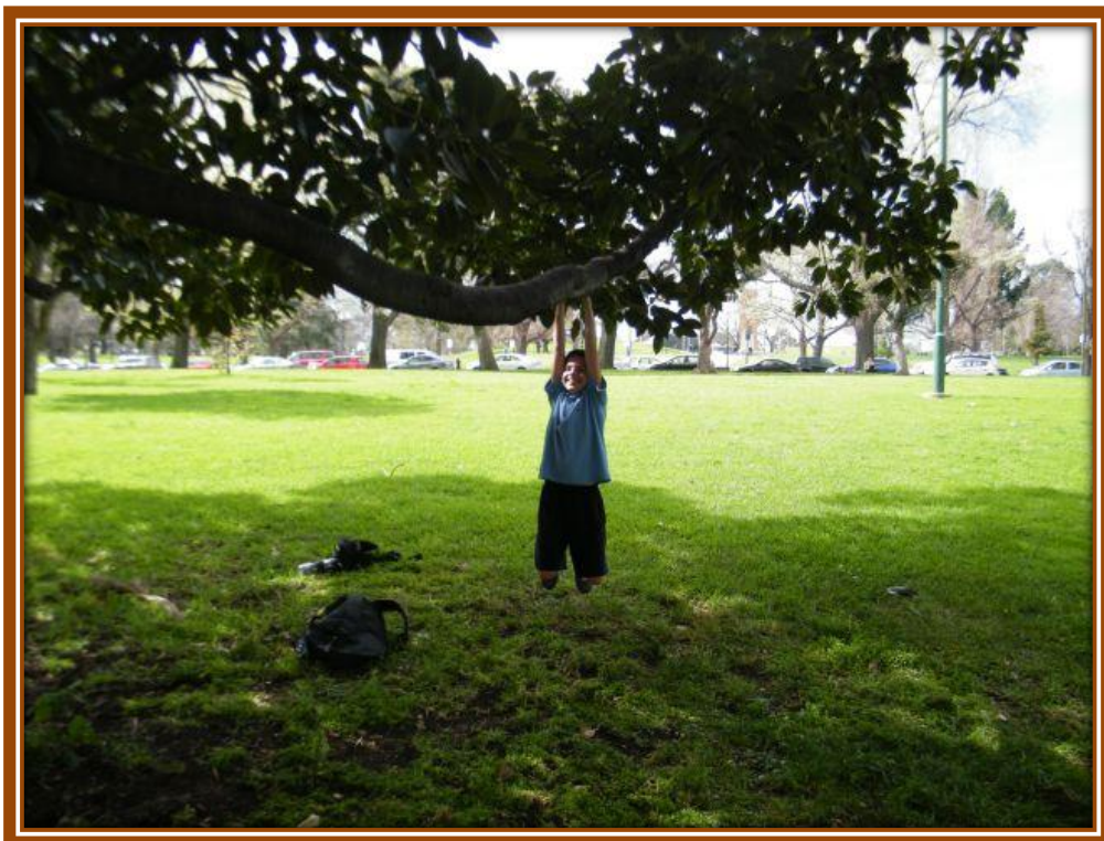
Just “hanging around”