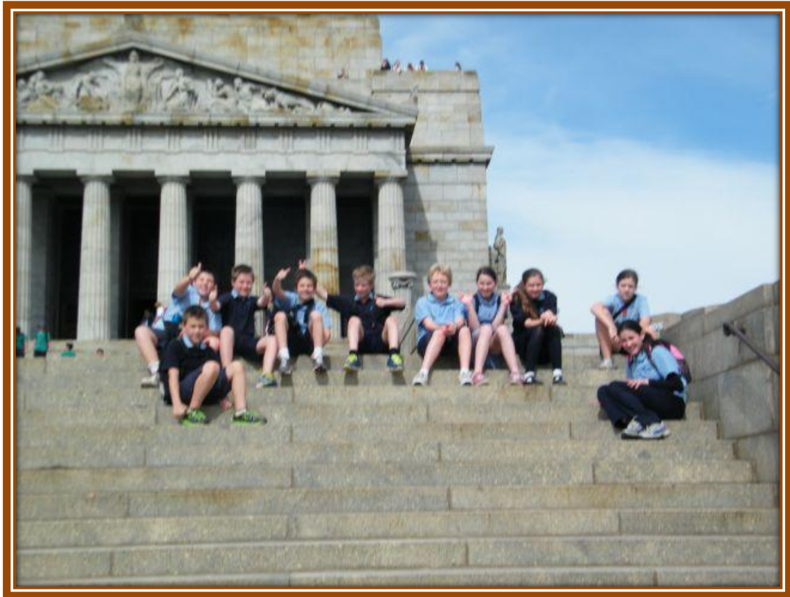
Sitting on the steps of the “Shrine of Remembrance”