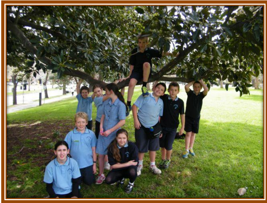
Under the shade of a beautiful tree: in the Alexandra Gardens.